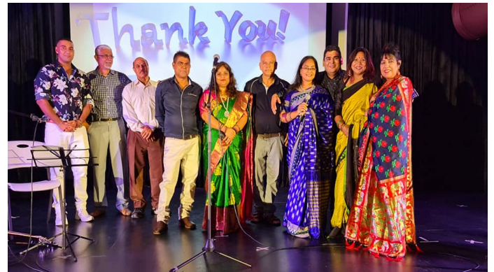
Photo: The New Executive Committee at the ICS Diwali 2020